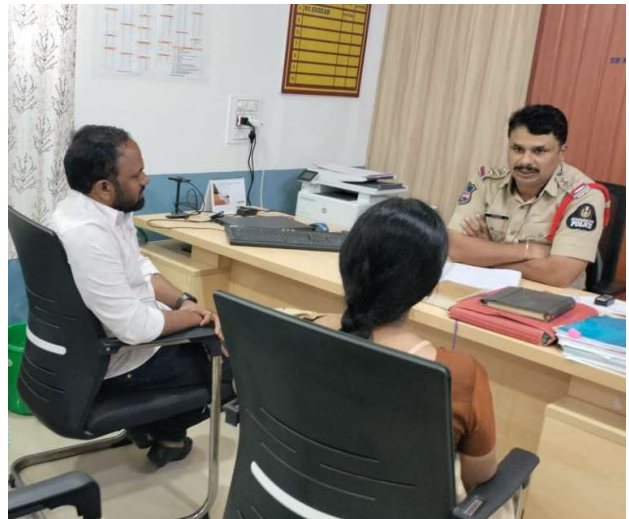
Pic 2 – Interview with SHO, Borabanda