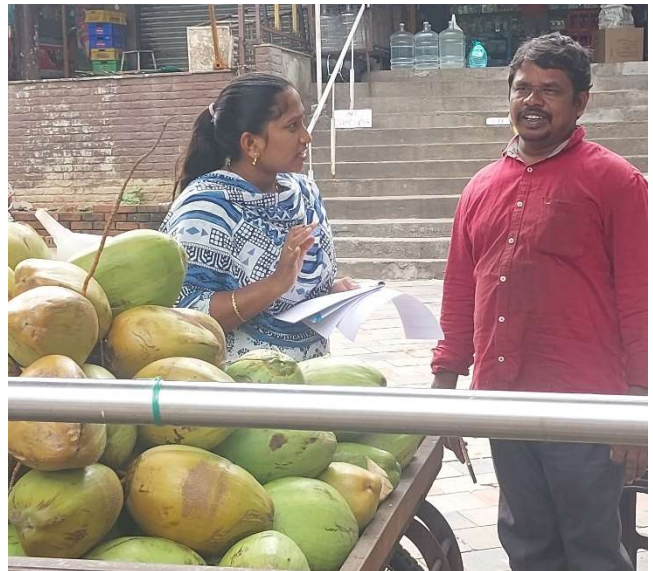
Pic 5 – Interaction with a Street Vendor