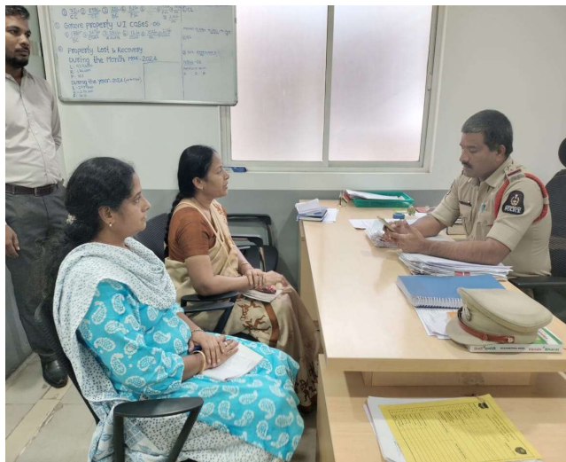
Pic 3 – Interview with SHO, Madhura Nagar