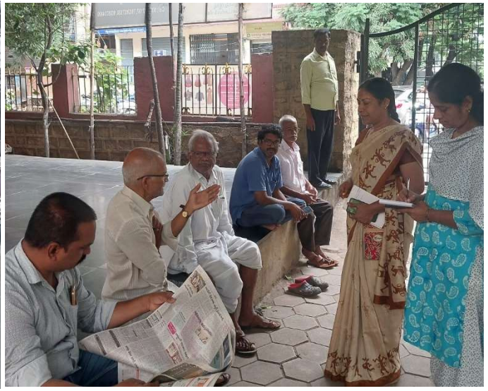
Pic 9 – Interaction with Colony Residents