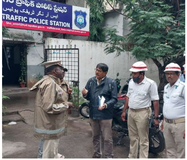
Pic 21 & 22 – Interaction with traffic Police Inspectors & the Commuter