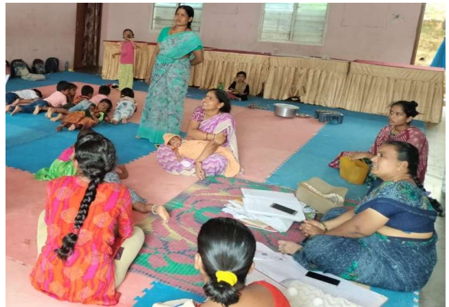
Pic 19 – Interaction with Anganwadi Teacher & Residents