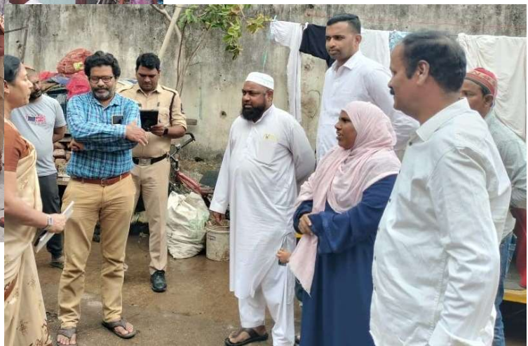
Pic 20 – Interaction with Basti Leaders and Community Members