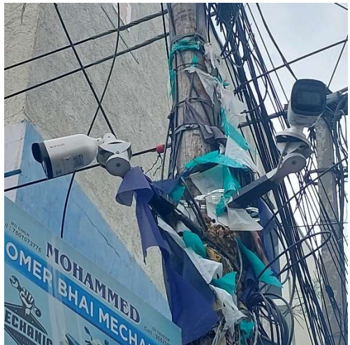
Pic 11 to 16 – CCTV Cameras set up in different main roads and lanes of the three localities