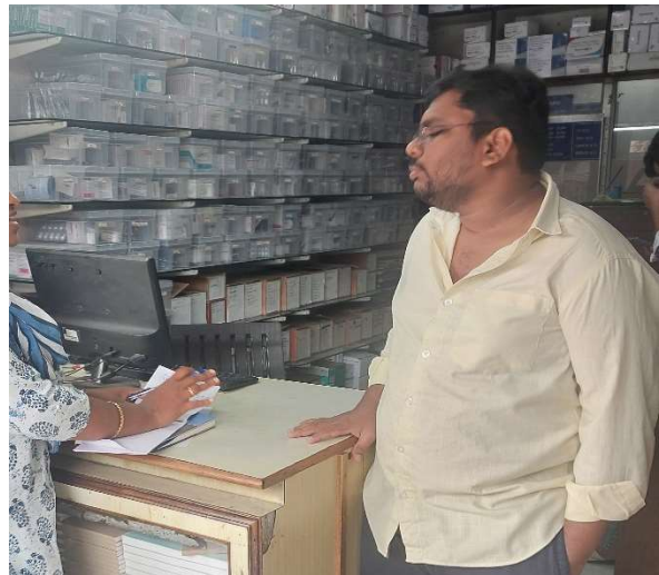
Pic 6 & 7 – Interactions with Sugarcane Juice Vendor and a Medical Shop Owner