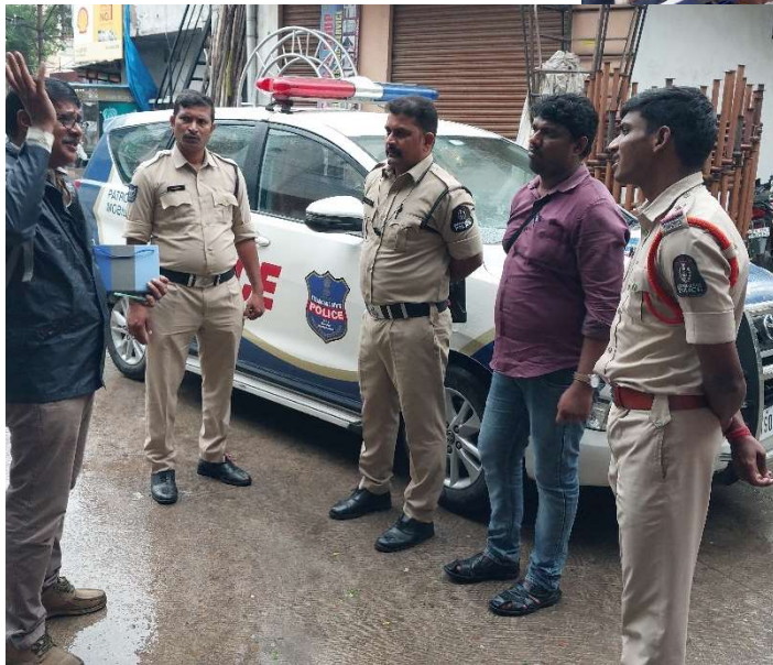
Pic 24 – Interaction with Police Patrolling Team

“Through surveillance lenses, we protect the present and secure the future”