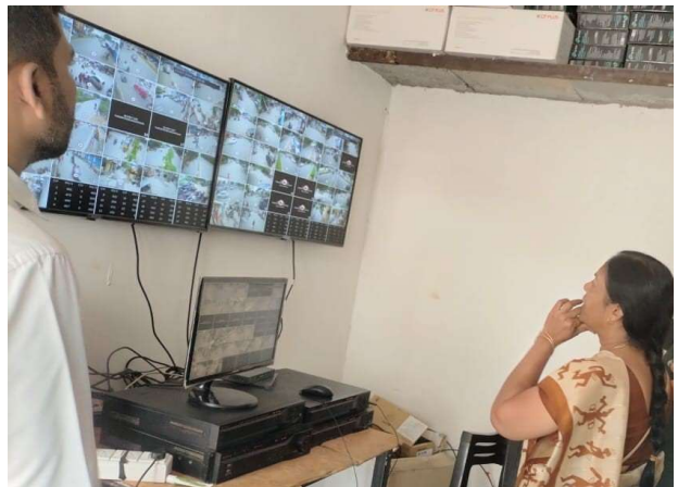
Pic 17 & 18 – Interaction with IT Cell Constable & Technical Team