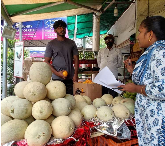
Pic 4 – Interaction with a Fruits Vendor