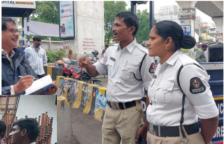
Pic 23 – Interaction with Traffic Police Constables