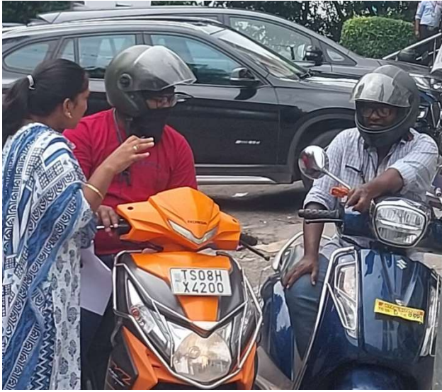
Pic 8 – Interaction with Commuters