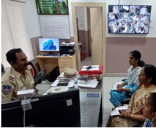
Pic 1 – Interview with SHO, Jubilee Hills